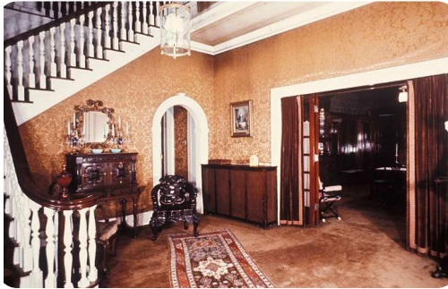
Entrance foyer with original furnishings.