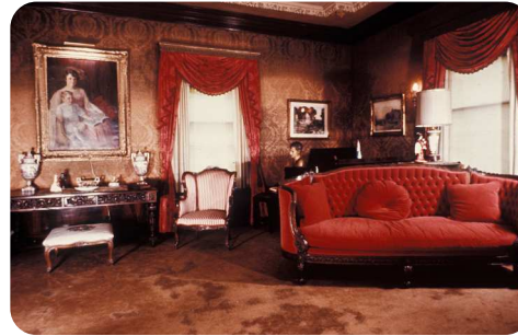
Living room with original furnishings.